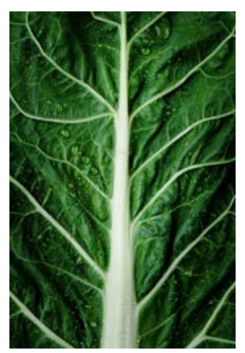
Featured Image #3 Yone Liau | The Tree of Life in a Chard