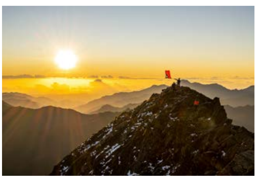
Featured Image #1 Neil Wade | Patriotic Yushan Sunrise