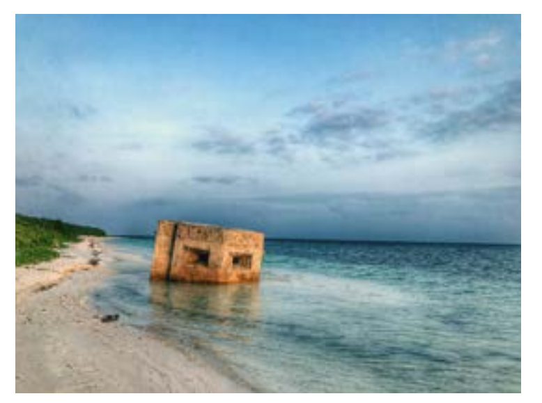
Featured Image #2 Shashank Keshavmurthy | Beach on Dongsha Atoll